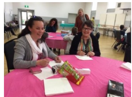
Turning the Staff into a snake